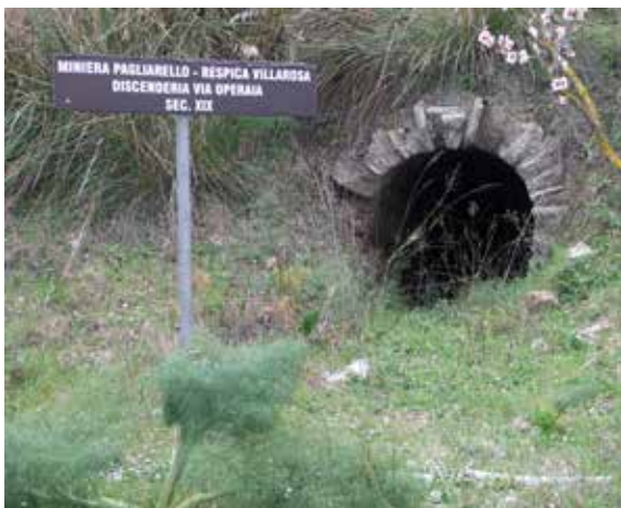
The entrance to one of the mines at Villarosa

Unlike in Iceland, where the sulphur occurs on the surface and can just be dug up, the sulphur in Sicily occurs underground and mines have to be sunk to reach the deposits. The sulphur occurs not as in Iceland, in a fairly pure condition, but intricately bound up with the rock matrix. The miners, especially up to the 20th century, were frequently young men, youths and often, children. Unfortunately due to the fact that the sulphur was extracted from deep mines these were not accessible so that it was not possible to see the sulphur in situ. However through the assistance of Primo David we were able to collect some samples of the ore for analysis.