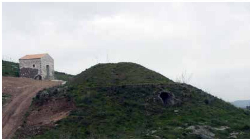
An early form of calcarone – just a simple pile of the sulphur ore enclosed with in a stone wall

This exceptionally wasteful process, in which only perhaps one-third of the sulphur was recovered, was improved by conducting the heating in a sort of kiln. A semicircular or semi-elliptical pit, called in Sicily a calcarone, about 10 metres in diameter and 2.5 metres deep is dug into the slope of a hill, and the sides are faced with stone. The base, called the sole consists of two halves slanting against each other, the line of intersection forming a descending gutter which runs to the outlet. This outlet having been closed by small stones and sulphate of lime cement, the pit is filled with sulphur ore, which is heaped up considerably beyond the edge of the pit and covered with a layer of burnt-out ore. In building up the heap a number of narrow vertical passages are left to afford a draught for the fire. The ore is kindled from above and the fire so regulated by the combustion of the least sufficient quantity of sulphur, the rest is liquefied. The molten sulphur accumulates on the sole, whence it is from time to time run out into a square stone receptacle, from which it is ladled into damp moulds, of truncated cone shape and made of poplar, each cake weighing about 50 to 60 kg. A calcarone with a capacity of about 825 cubic metres burns for about two months, and yields about 200 tonnes of sulphur. The yield is about 50%.