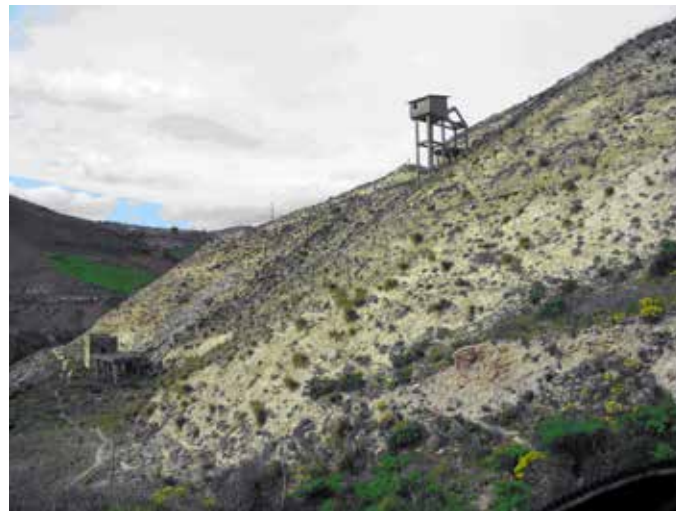
Some of the 19th century remains of the industry

Seeing the industry in Sicily was a fitting finale to the Group's investigations of the primary sources of sulphur in the medieval and early modern periods. It will enable us to compare the different sites, Iceland and Sicily, and the sulphur that each produced helping us to more fully understand the amazing material that is medieval gunpowder.