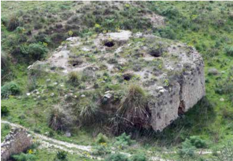
A later form of calcarone in which the sulphur was packed into four chambers – the tops of which can be seen here

Later on this simple form of kiln was replaced by a type in which there were a number of individual chambers into which the sulphur ore was loaded from the top.