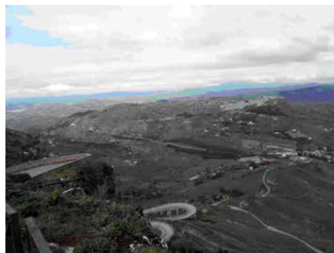
View towards the sulphur area of Villarosa showing the easy access by road – the new autostrada following the route of the old road to the coast