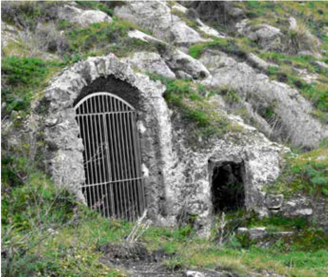
A mine at Comitini