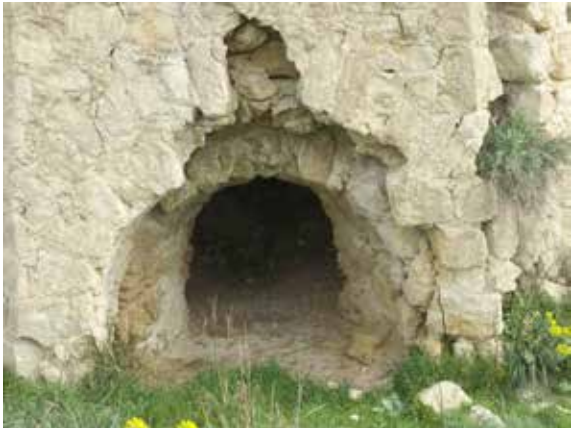
The side of the calcarone showing where the sulphur collected and was run out into moulds