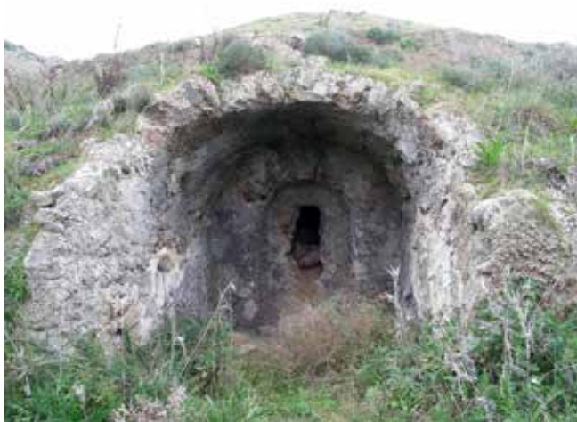
The front of the calcarone showing where the molten sulphur collected and was run out into wooden moulds