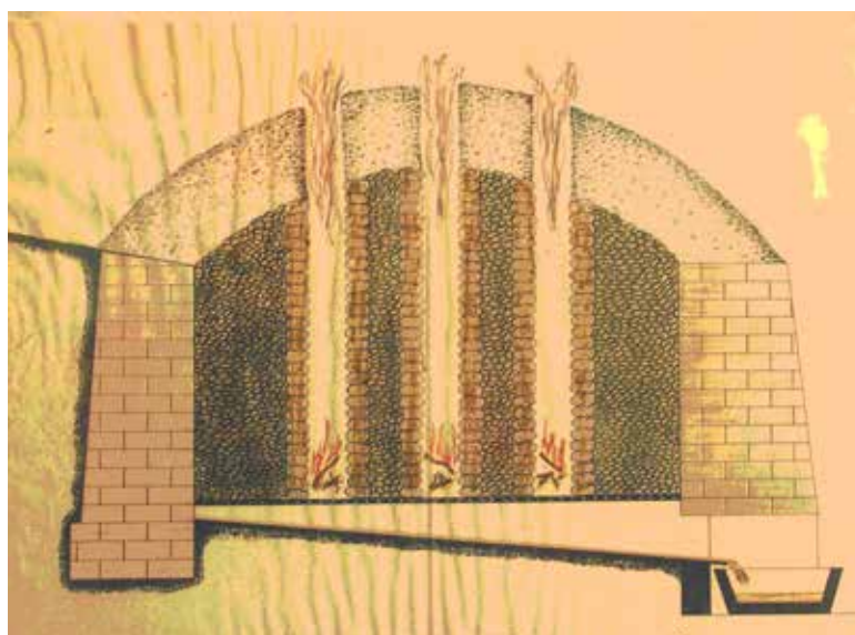
Drawing showing how the sulphur was burnt in a large kiln called a calcarone

The simplest and crudest method was to put a huge mass of the ore in a hole in the ground and set light to it. After a time the heat melted a part of the sulphur which runs down to the bottom of the hole from where it was ladled out.