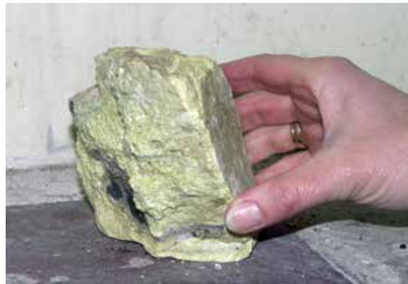
A piece of the sulphur ore